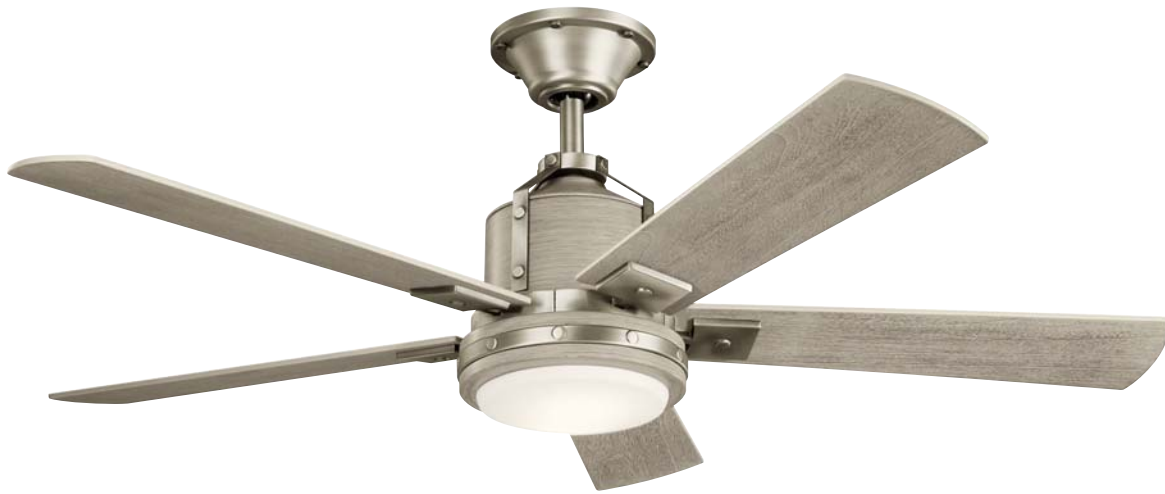
B | 300052 NI Brushed Nickel Finish Weathered White Walnut Blades