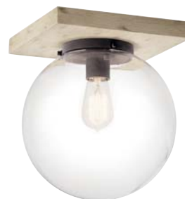
E | 44299 WWW Flush Mount