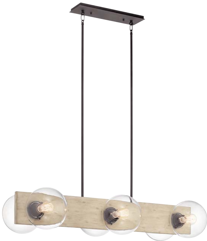
B | 44296 WWW Linear Chandelier