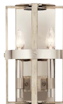
D | 44292 WWW Wall Sconce