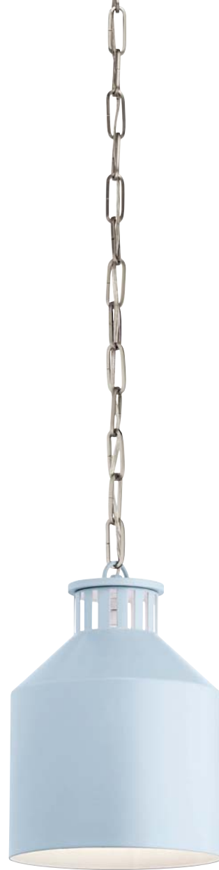
B | 44306 LBL Mini Pendant