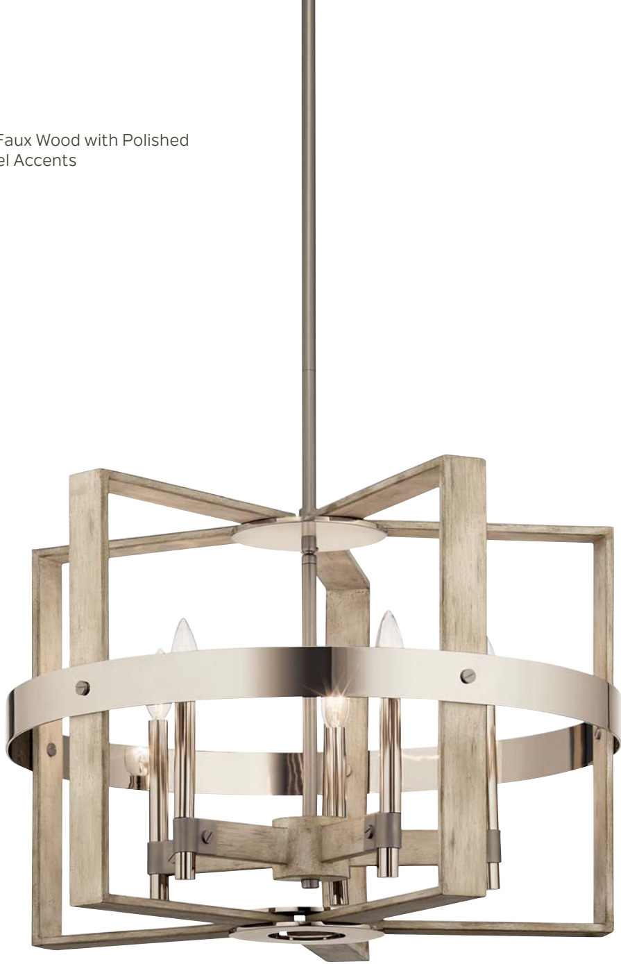
A | 44290 WWW Chandelier NOT TO SCALE

Finish: Whitewashed Faux Wood with Polished and Satin Nickel Accents