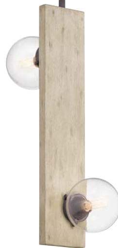
C | 44297 WWW Pendant