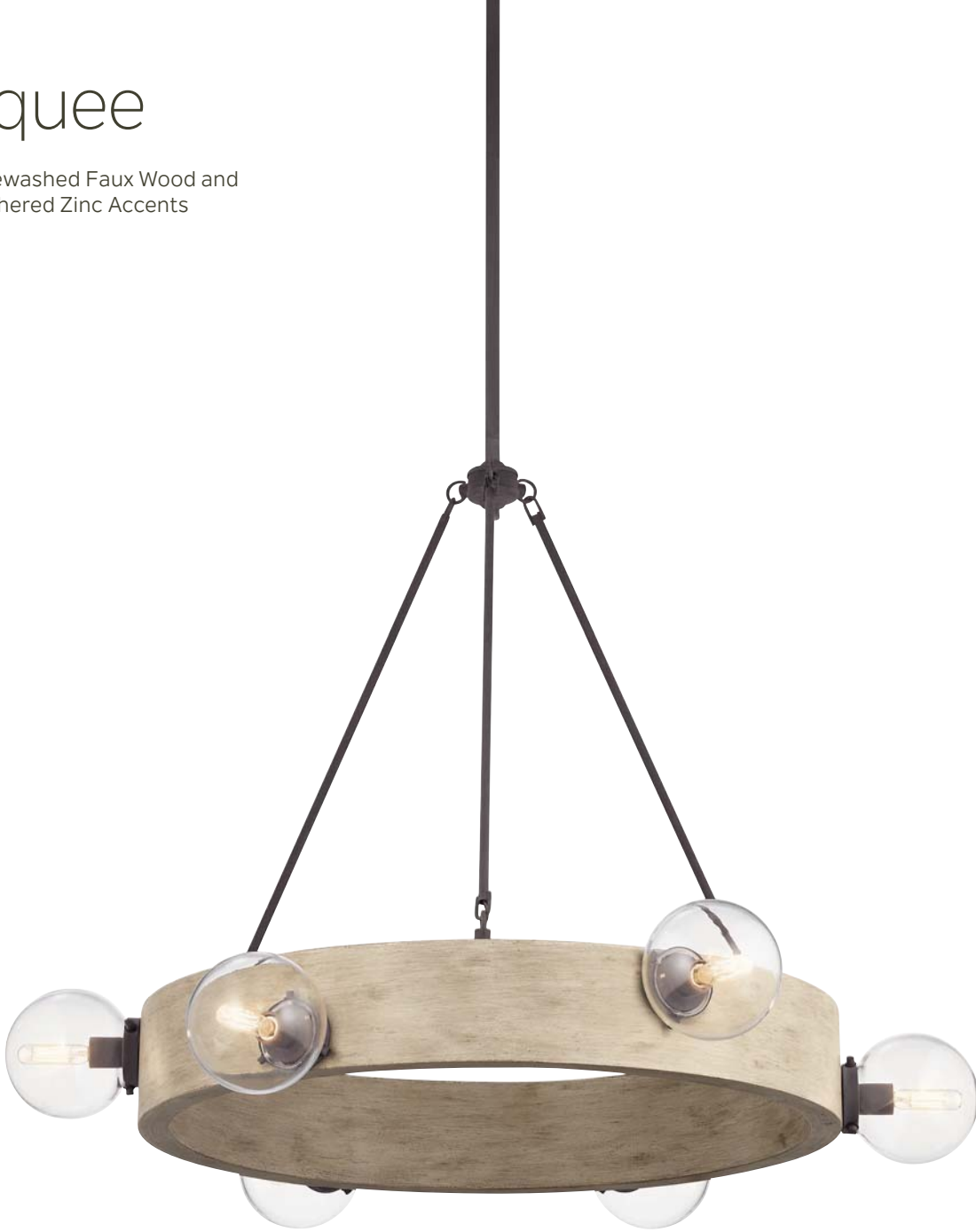
A | 44295 WWW Chandelier NOT TO SCALE

Finish: Whitewashed Faux Wood and Weathered Zinc Accents Glass: Clear