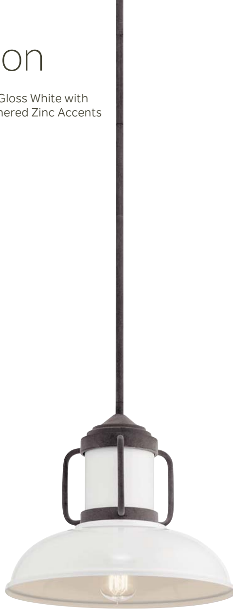
B | 44302 WZC Pendant