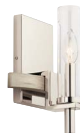
D | 44287 WWW Wall Sconce