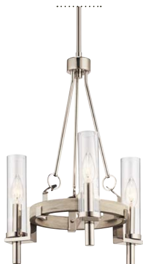
C | 44286 WWW Mini Chandelier