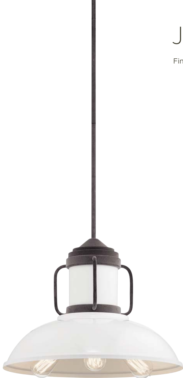
A | 44303 WZC Pendant

Finish: High Gloss White with Weathered Zinc Accents