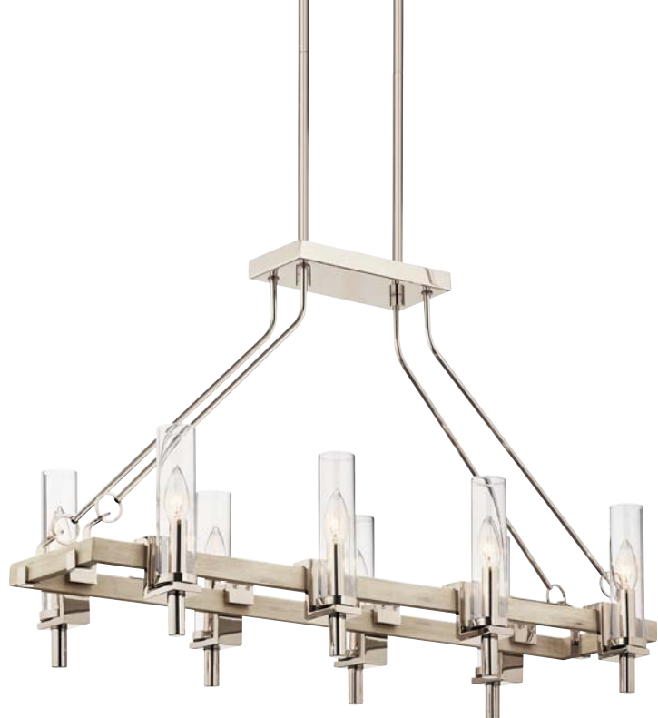
A | 44285 WWW Linear Chandelier NOT TO SCALE