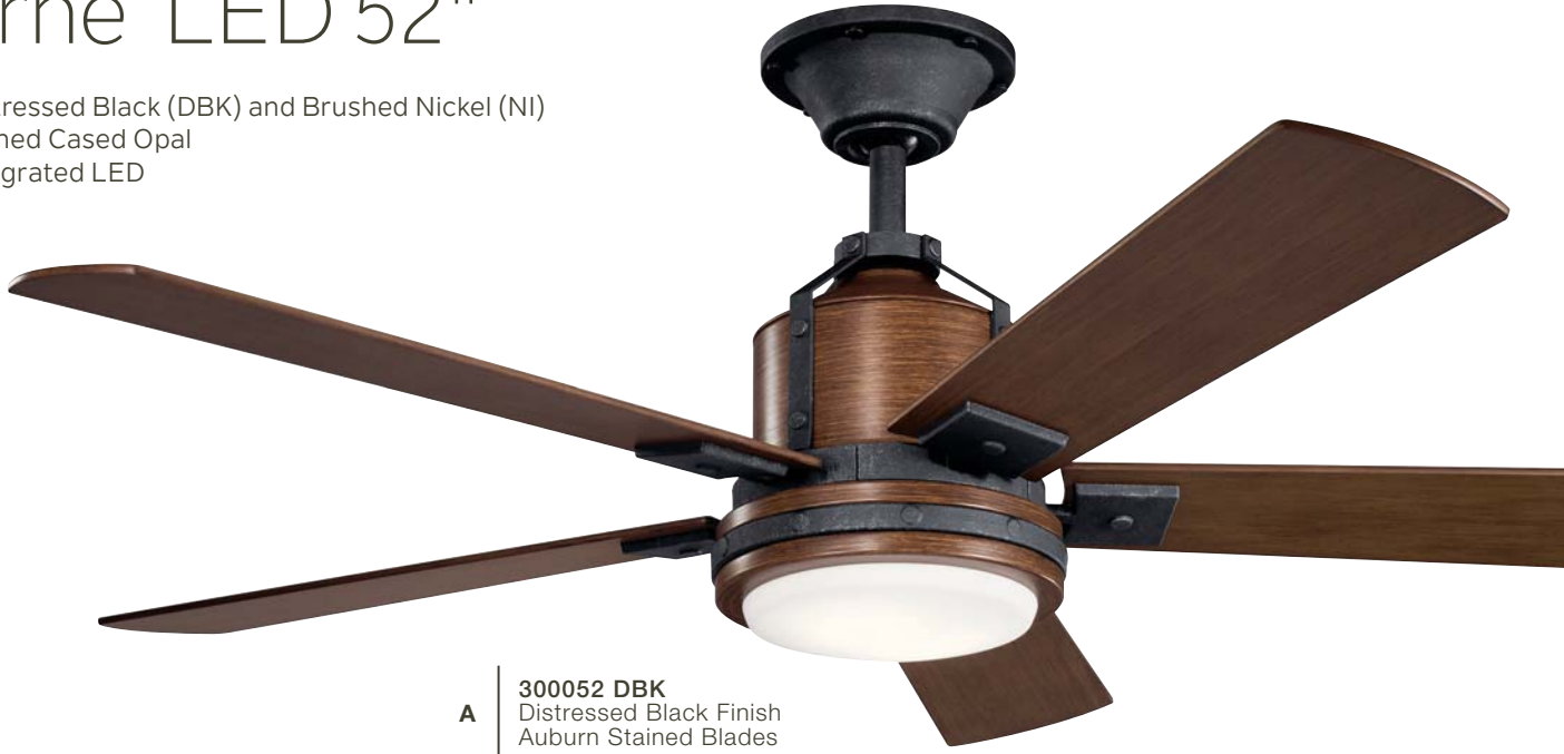
A | 300052 DBK Distressed Black Finish Auburn Stained Blades

Finishes: Distressed Black (DBK) and Brushed Nickel (NI) Glass: Etched Cased Opal Light: Integrated LED