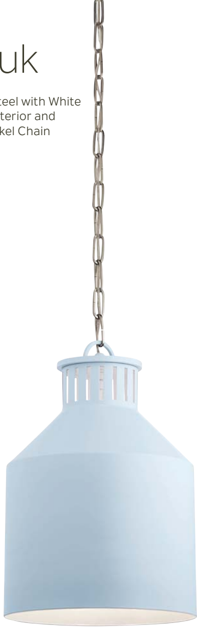
A | 44307 LBL Pendant

Finish: Light Blue Steel with White Enameled Interior and Brushed Nickel Chain