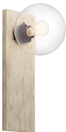
D | 44298 WWW Wall Sconce