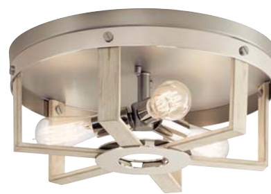
C | 44293 WWW Flush Mount