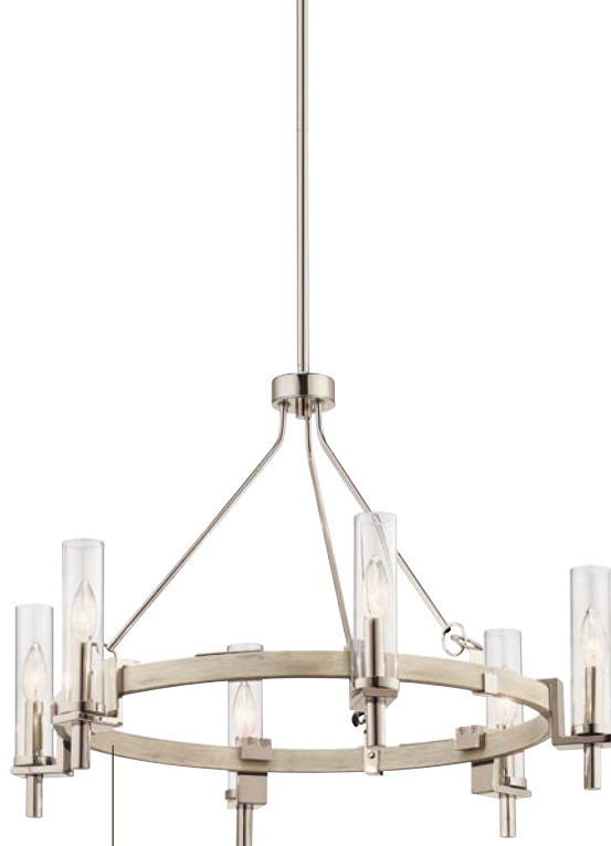
Whitewashed Faux Wood B | 44284 WWW Chandelier