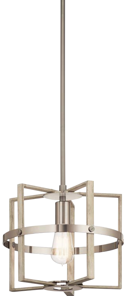
B | 44291 WWW Pendant